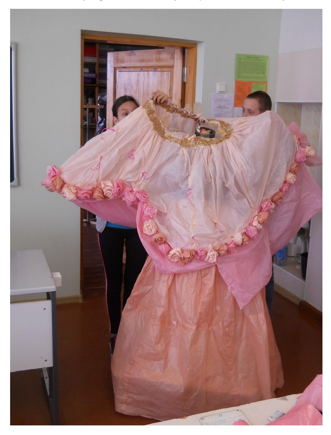
The skirt was very big and rather heavy, we put it on the dummy.