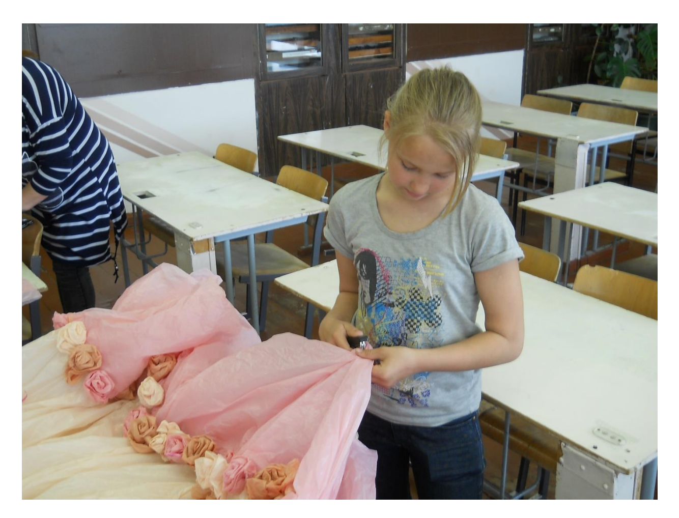
Then we attached each rose across the bottom of the skirt. We used staplers and scotch tape.